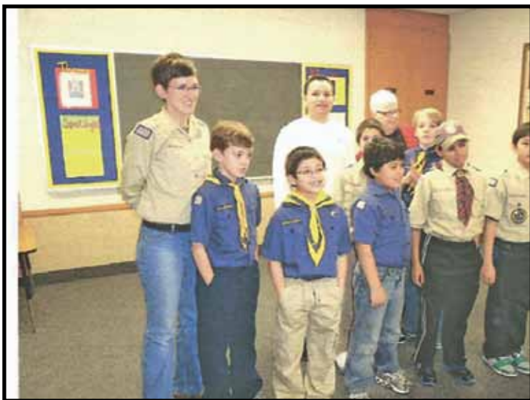
Pack #22- Queens, Elmhurst, N. Y. @ Rego Park 1st Ward The Mormon Church To help in this celebration, each Pack will take one Sunday of February to worship in full uniforms of the "best" Scouts in Queens!