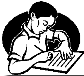
The Road To Knowledge Begins With The Turn Of The Page

"Given this track record, the modest cost of the program and the many families facing the prospect of losing their homes," the senators write, "we respectfully urge you to commit to the continuation and funding of the program."