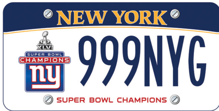
Super Bowl XLVI Plate Commemorates Victory