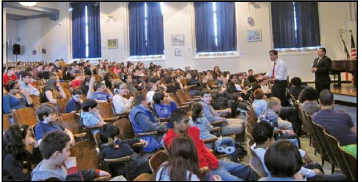
At P.S. 146, Assemblyman Phillip Goldfeder and Senator Joseph Addabbo spoke to a room of nearly 200 students during “Respect for All” week in Howard Beach. The elected officials addressed the students on how to conduct themselves inside and outside the classroom with respect for their peers and teachers.