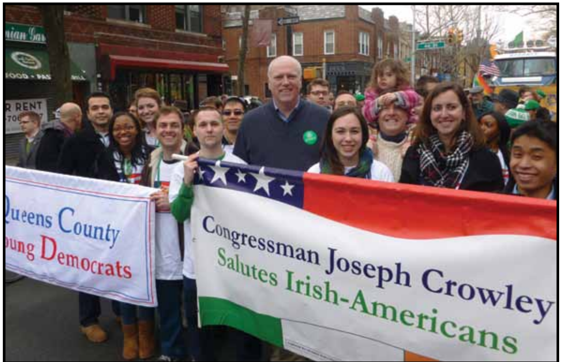
On Sunday, March 4, Congressman Joe Crowley and the Queens County Young Democrats marched in the St. Pat's for All parade in Woodside/Sunnyside. Pictured is Congressman Crowley with members of the Queens County Young Democrats at the parade.